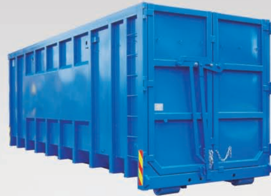
▲ MK 46 LP (LP - Logo plate version with a logo on the side wall)